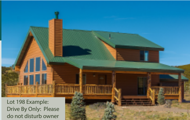
Lot 198 Example: Drive By Only: Please do not disturb owner

Base Prices DO NOT include a Parcel (see opposite side).