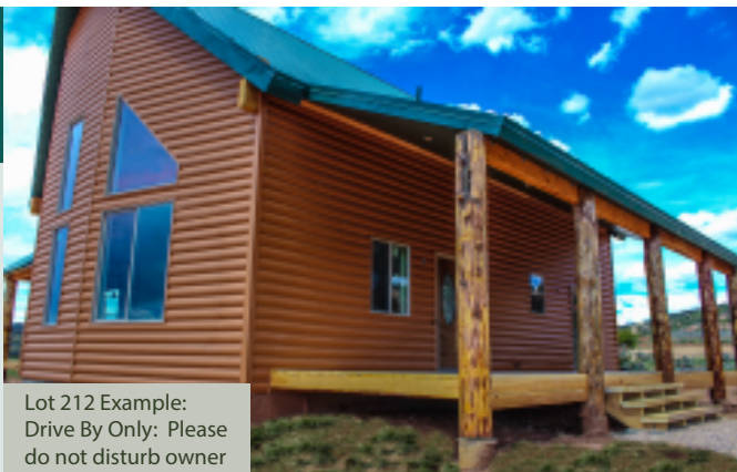
Lot 212 Example: Drive By Only: Please do not disturb owner

Appointment Recommended but not Required