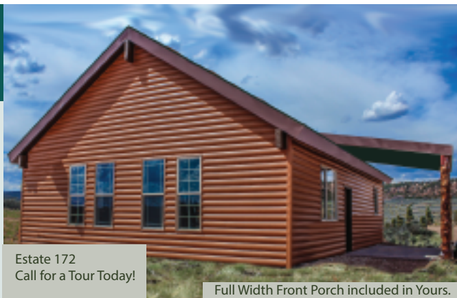
Estate 172 Call for a Tour Today!

Full Width Front Porch included in Yours.